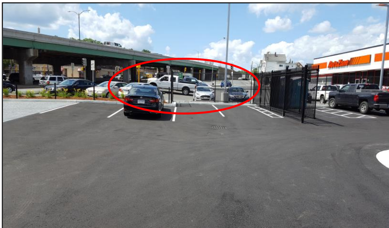
Bottom left: image of one of the new, black-coated 8-foot fences.