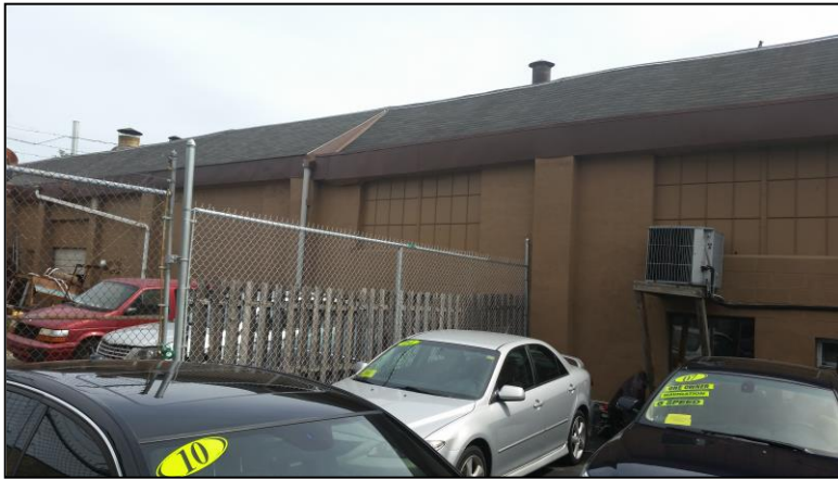
Top left: image of one of the old 8-foot, chain-link fences.